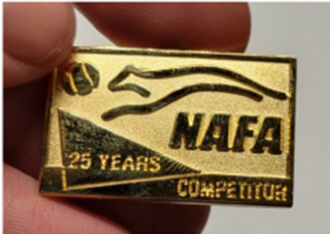
Picture of simialr pin for reference

NAFA 30 Year Pin, 50 custom made 1 inch die struck gold brass plated with matte metal in the recessed areas, 1 clutch back are $3.75 each