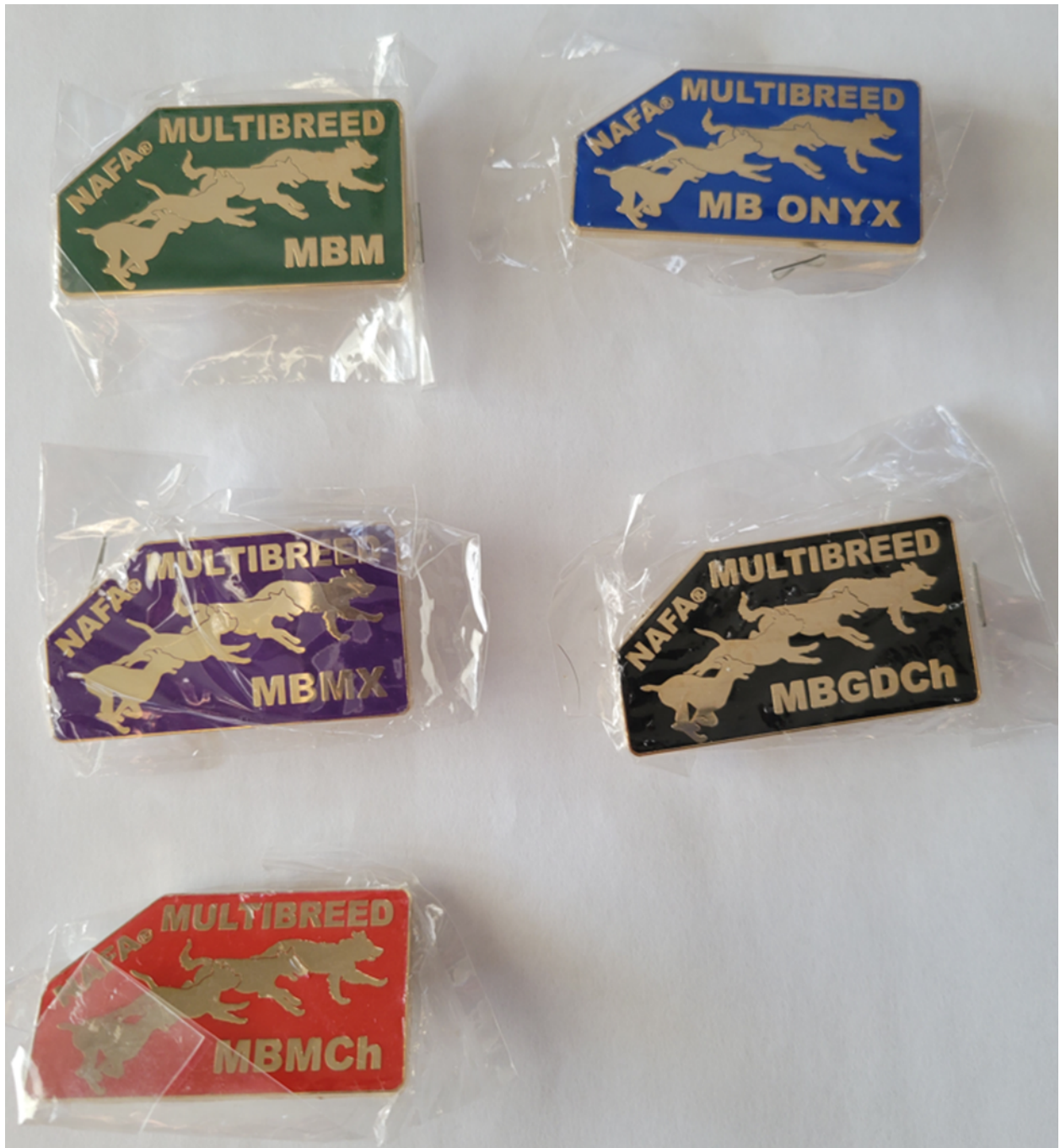
Proposal for 40,000 and 50,000 point multibreed pins.