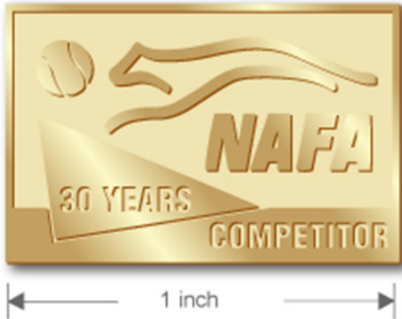
NAFA 30 Year Pin